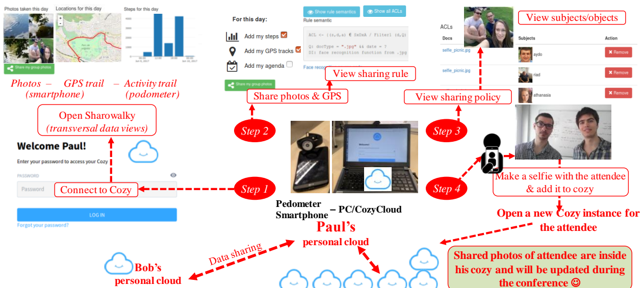
Fig. 3. Demonstration scenario. Video available at http://wanda.inria.fr/demos/videos/swyswyk_model.avi